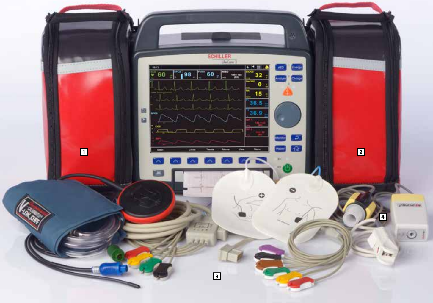
1 Left lateral pouch: ECG, NIBP, electrodes, left paddle, LifePoint