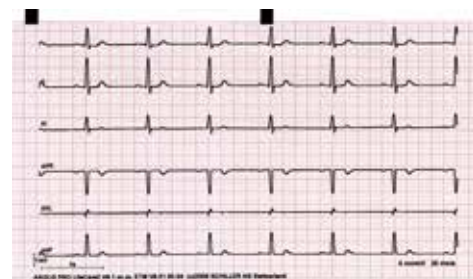
12 leads in the resting ECG display

2 USB INTERFACES: Export of intervention data to a USB memory stick, saving and loading device configurations, software update