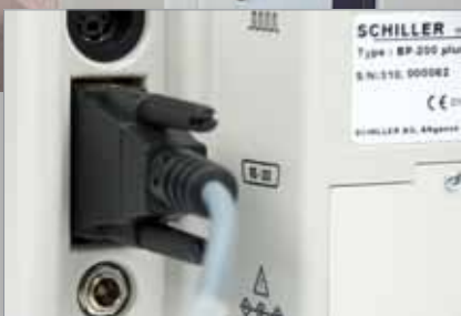
RS-232 capability to most ECG systems