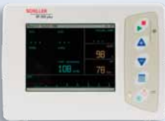
See and hear the Korotkoff sounds using the onscreen display and the included headphones