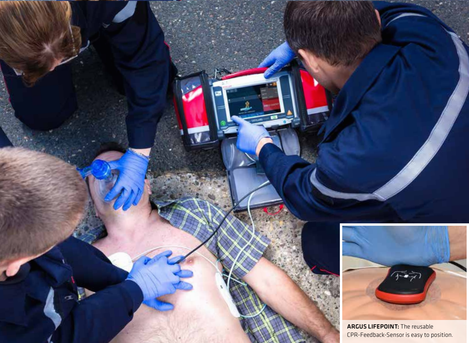
ARGUS LIFEPOINT: The reusable CPR-Feedback-Sensor is easy to position.