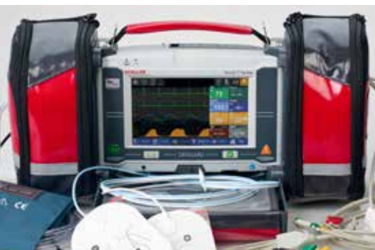
DEFIGARD TOUCH 7 MONITOR / DEFIBRILLATOR