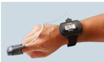
Wireless SpO 2 sensor, attached for the night