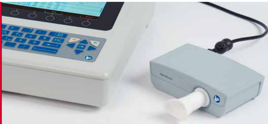
SpiroScout SP plus, for spirometry tests with the CARDIOVIT AT-102 G2